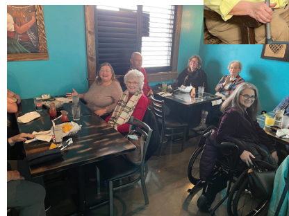
Mecate Lunch Outing