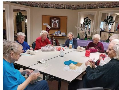
Knitting baby blankets for Strong